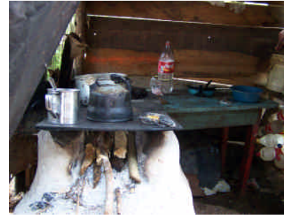
The cooking area for her home.