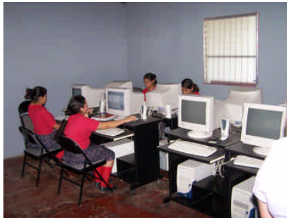
These young ladies are attending a Private Technological School in Santa Cruz.

Did you know studies indicate that investments in developing countries that improve the nourishment and education received by children yield the highest benefit to the recipient? To expand the support that we provide the children of Osman Hope, we are excited to tell you about the Osman Hope Scholarship Program that we are developing. In Honduras, public education is not free. Parents not only