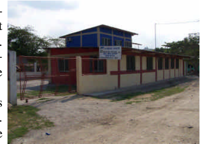
The San Pedro Sula Shelter with its freshly painted walls.

At the first of the year, we provided funds for the San Pedro Sula Shelter to put